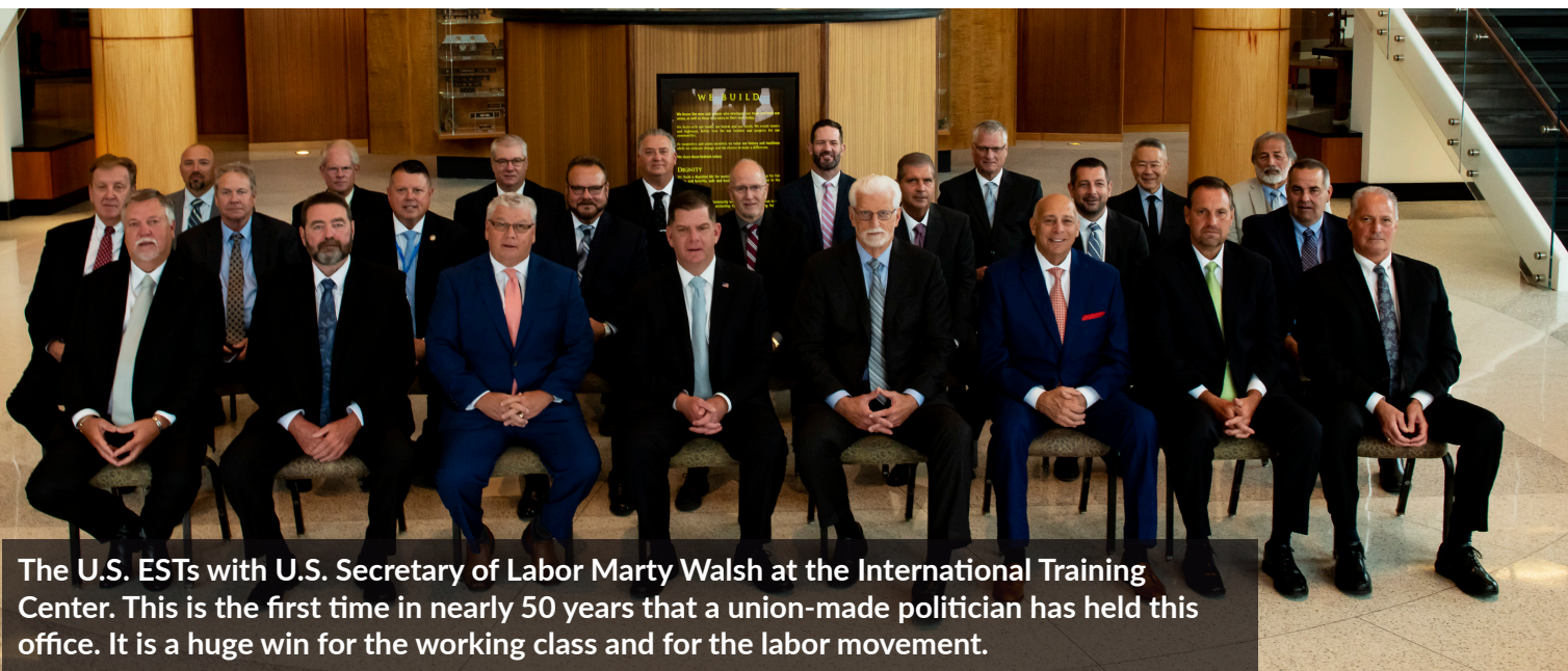
The U.S. ESTs with U.S. Secretary of Labor Marty Walsh at the International Training Center. This is the first time in nearly 50 years that a union-made politician has held this office. It is a huge win for the working class and for the labor movement.

I like the union for what it stands for and I believe wholeheartedly in what we're trying to accomplish as an organization. I enjoy the work but more importantly, I enjoy working with the people around me. We have people who make themselves available around the clock to help members. We have staff going to different departments to find answers, and staff speaking with members who are looking for guidance for long periods of time. I see it and I appreciate all the hard work everyone puts into helping each other.