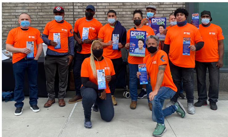
Members supporting City Councilwoman Crystal Hudson, District 35 in Brooklyn.

As the New York City June 22nd primary election drew near, our members came out for our endorsed candidates in full force! As carpenters, we support those who support us. We marched on streets, knocked on doors, canvassed for candidates, and spread the word that carpenters are rising on the political front. It is up to us to become a political powerhouse and take back market share. Check out some of the work our members did for labor-friendly candidates below.