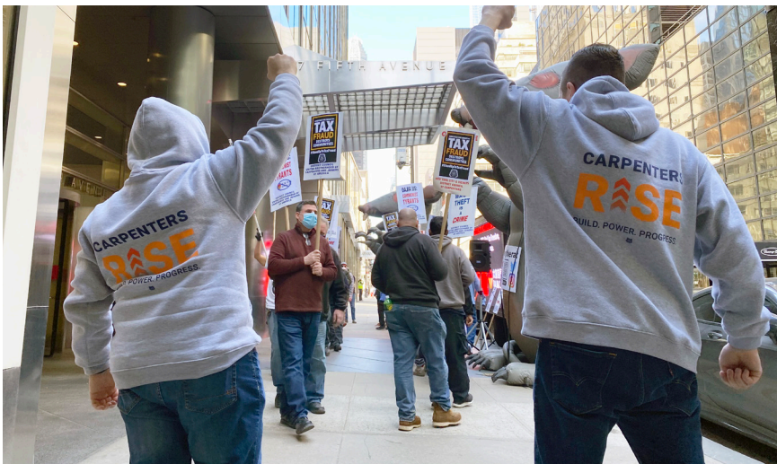
Members stood outside the Waldorf Astoria Towers Development to protest the hiring of Trident, a non-union company that provides no healthcare and has no area standard wages.