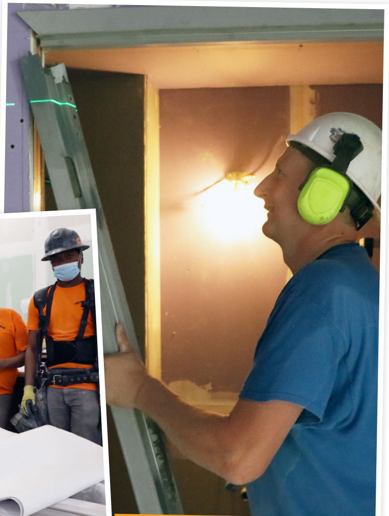
Bishop Valero Residence