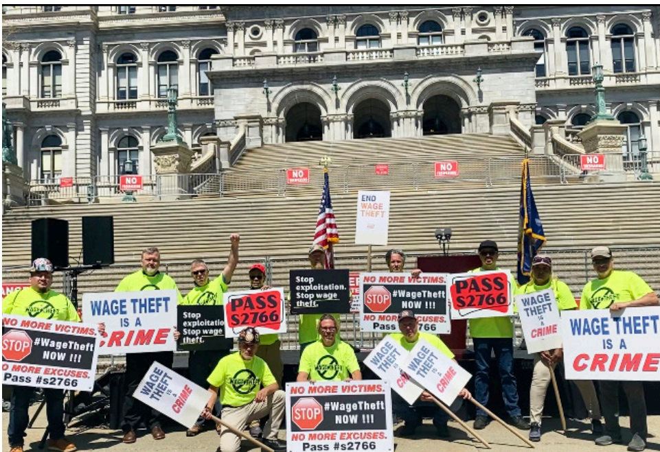
Members traveled up to Albany to let lawmakers know we won't stand for stolen wages!