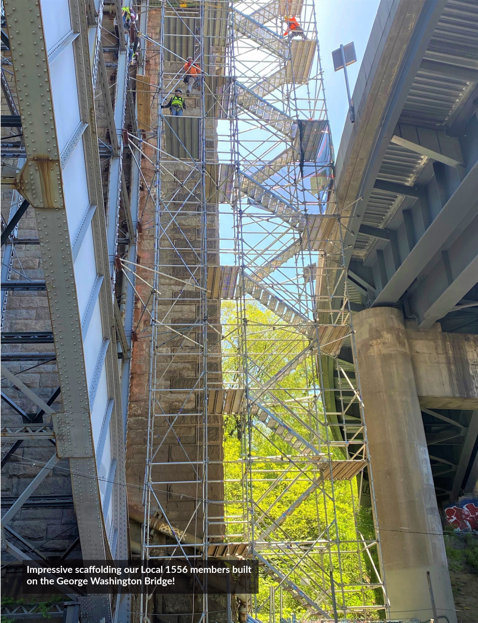
Impressive scaffolding our Local 1556 members built on the George Washington Bridge!