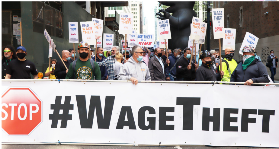
Members march at the wage theft rally.

Over the past few months, the District Council held multiple rallies, marched through the streets, informed the public through social media and op-eds, and put pressure on Albany through billboards and outreach campaigns. We mobilized together to tell lawmakers it was time to combat this egregious violation of workers' rights. It all culminated in an End Wage Theft Rally on May 6th with elected officials, members, and partner organizations.