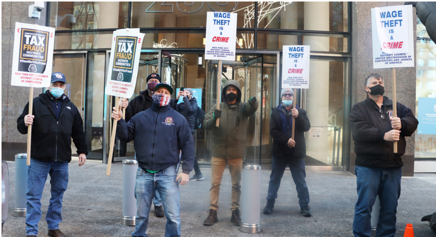
Members stand up to wage theft at 250 Vesey Street.