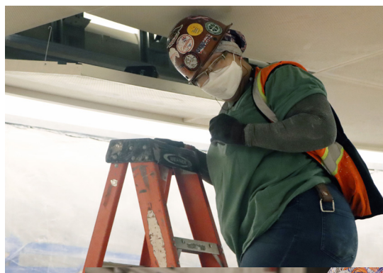
Members hard at work at the East Side Access project.

"I tell them, this is a historic job and if you're lucky enough, you get a job like this once in your career. Be proud of what you're doing. You're going to take your kids to see this. This is a historic job and you are part of it."