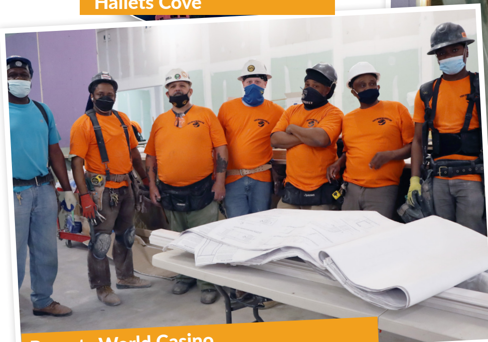
Resorts World Casino