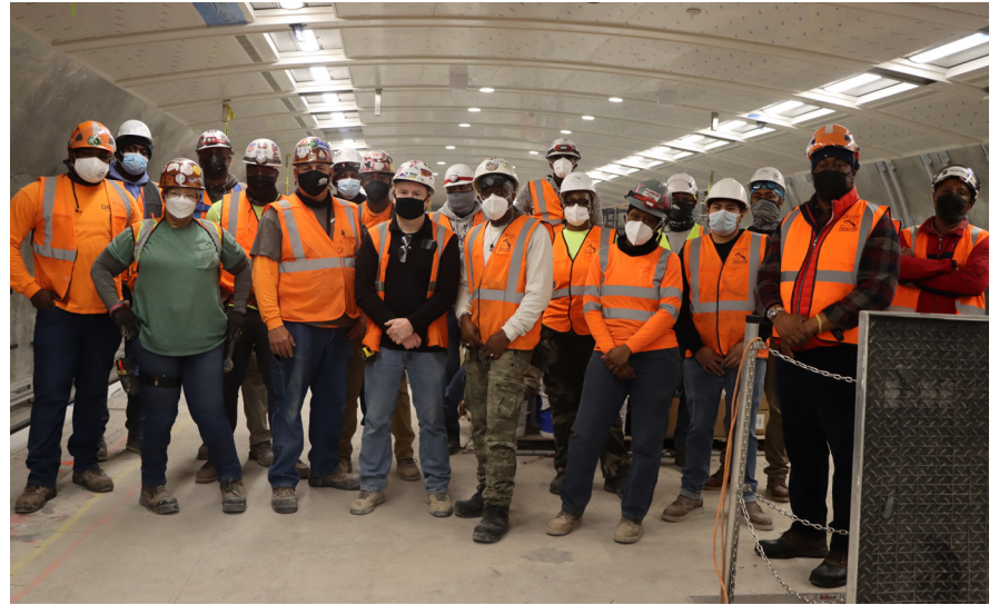
The Creative Construction team at the East Side Access Project.

"We are a small minority company and it was a challenge for us," he said. "There were those that said we couldn't do it because of the size of the project – we're talking about almost 200,000 sq. ft. (that's 3 ½ football fields!) of metal pan ceiling and aluminum, the logistics of securing the materials then transporting it, and making sure it worked. So far, we brought out almost 1,080 crates of materials. But we were able to get it done."