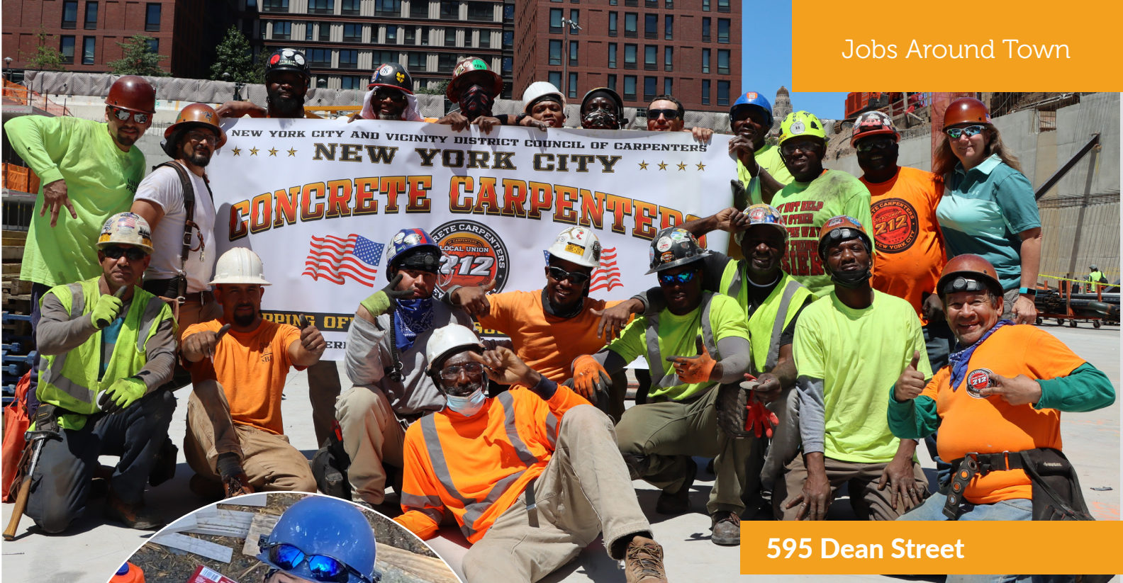
595 Dean Street