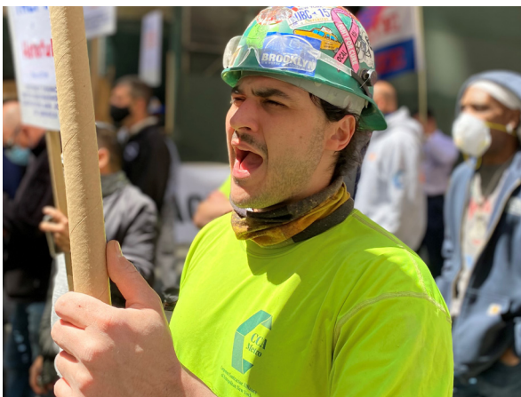
Members marching to pass the wage theft bill.