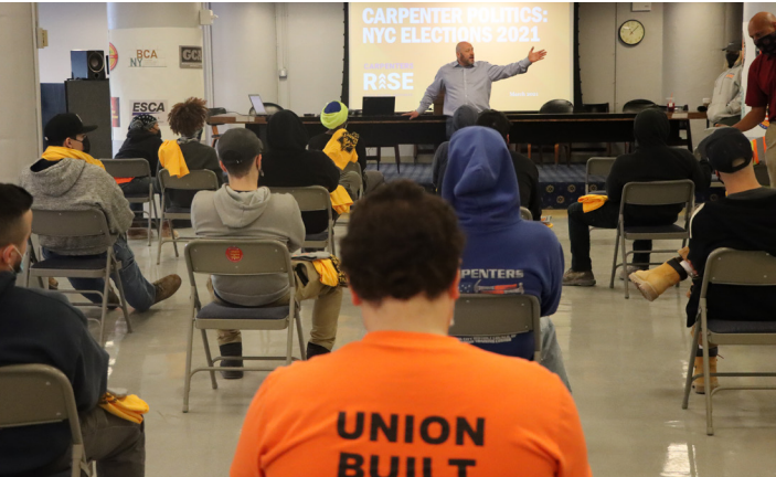
RISE training for apprentices on March 22nd.

In March, we were able to start holding in-person classes at the Carpenters Training Center. Each apprentice at the training center was able to learn about carpenter issues and why being active and engaged on the political front is necessary for us as carpenters to RISE. When carpenters come together with a collective voice, politicians listen. Creating a better world for the working people of New York involves understanding how to get legislation passed and working with those who will support union work.